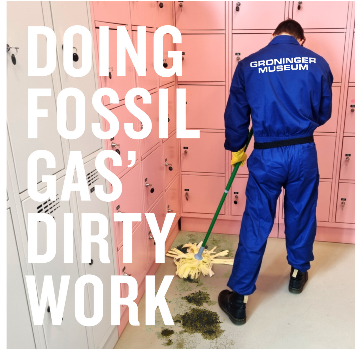
Sticker from the Cleaning the Museum sticker collection 10x10cm

This rapid broadening of perspectives, however, led ultimately to a core split in the second half of 2023. By the year's end, the process of a division had begun: one part of the founding group would establish a new foundation, and direct its efforts toward envisioning post-extractive cultures. The other part would remain committed to the mission of disobedient art, and dismantling the influence of the fossil fuel industry on our cultural sector.